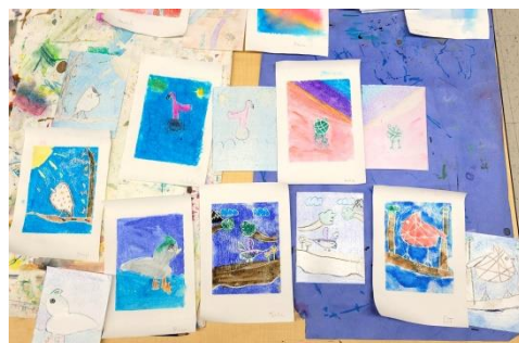
3 rd Grade Bird Prints

3 rd graders have enjoyed their adventures in ornithology (study of birds) as they seek to create 3 different labelled bird prints that will be mounted for optimal presentation. This project was a great way to learn about scientific illustrations, drawing from observation, planning a composition, and engaging in a simplified printing process. They will even get to mount their prints. Next, 3 rd graders will create a 3D perspective artwork containing early Wampanoag/ pilgrim dwellings and scenes.