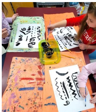
Kindergarten line compositions in progress!

Kindergarteners completed their Matisse-inspired collages, which were a fun way to "draw with scissors" like Matisse did, and layer organic shapes on top of geometric ones. They were introduced to the color wheel and learned that some colors "pop" when they are put together, because they are opposites (complements) on the color wheel. Students had fun trying out color combinations as they created their compositions. Currently Kindergarteners are learning about the many types of lines that exist in the world. We looked at the work of abstract artist Wassily Kandinsky, who was also a musician, and read the book "Lines that Wiggle". Students painted 2 line compositions in black tempera while listening to music ("Peter and The Wolf" by Prokofiev), to inspire varied lines. One will later be filled with primary colors and for the other they will learn how to mix secondary colors.