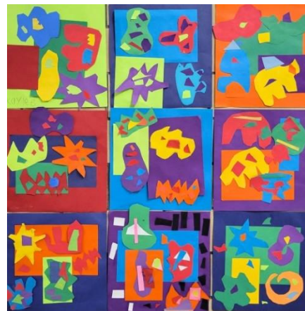
Kindergarten Matisse-inspired Collages. "Drawing with Scissors" (below)

In the meantime, here are the latest updates: