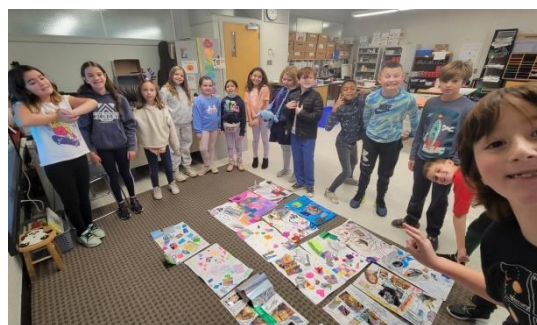
The last day of Art Explorations of McCarthy’s 3 rd grade class ended in reflection and critique. What a great 10 weeks!