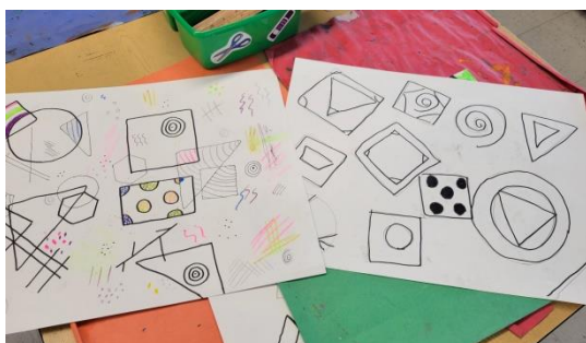
A great start to some 5 th grade abstract mixed media paintings. They are excited for the next step: liquid watercolors!