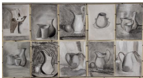
5 th grade finished still life charcoal drawings