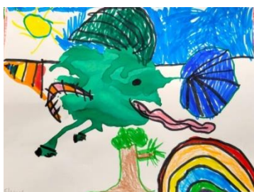
Kindergarten "Beautiful Oops" drawing by Eleanor S.